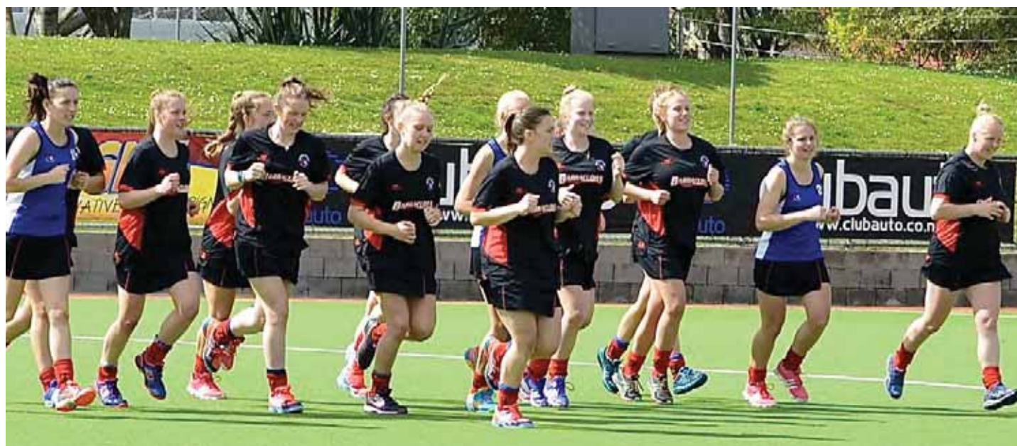
Barracudas warming up

Following a lean stretch, the Silver represented the third medal in three years for the Barracudas. They will be back in 2017 with a view to getting back onto the top of the podium.