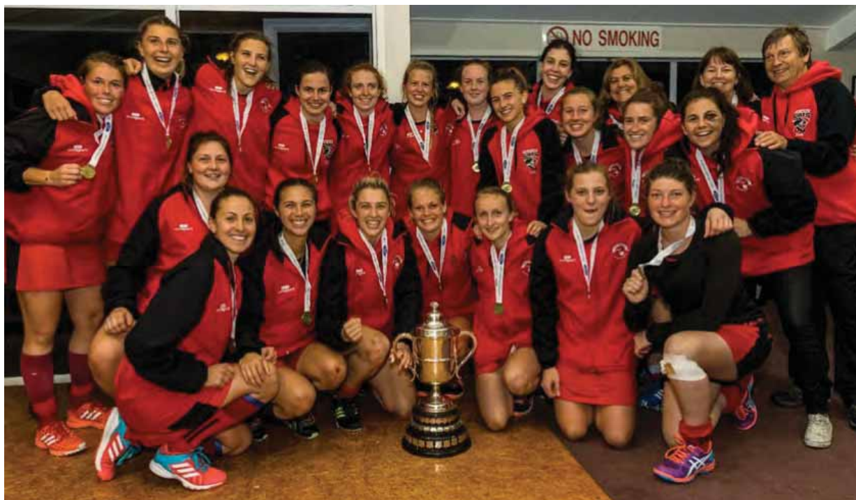
Champion Cats with the K-Cup after their 3-2 victory over North Harbour in the NHL Final