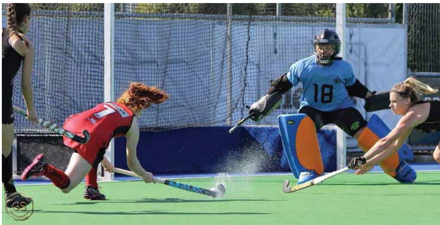
Goal mouth action against Capital in the round one match at Marist Park