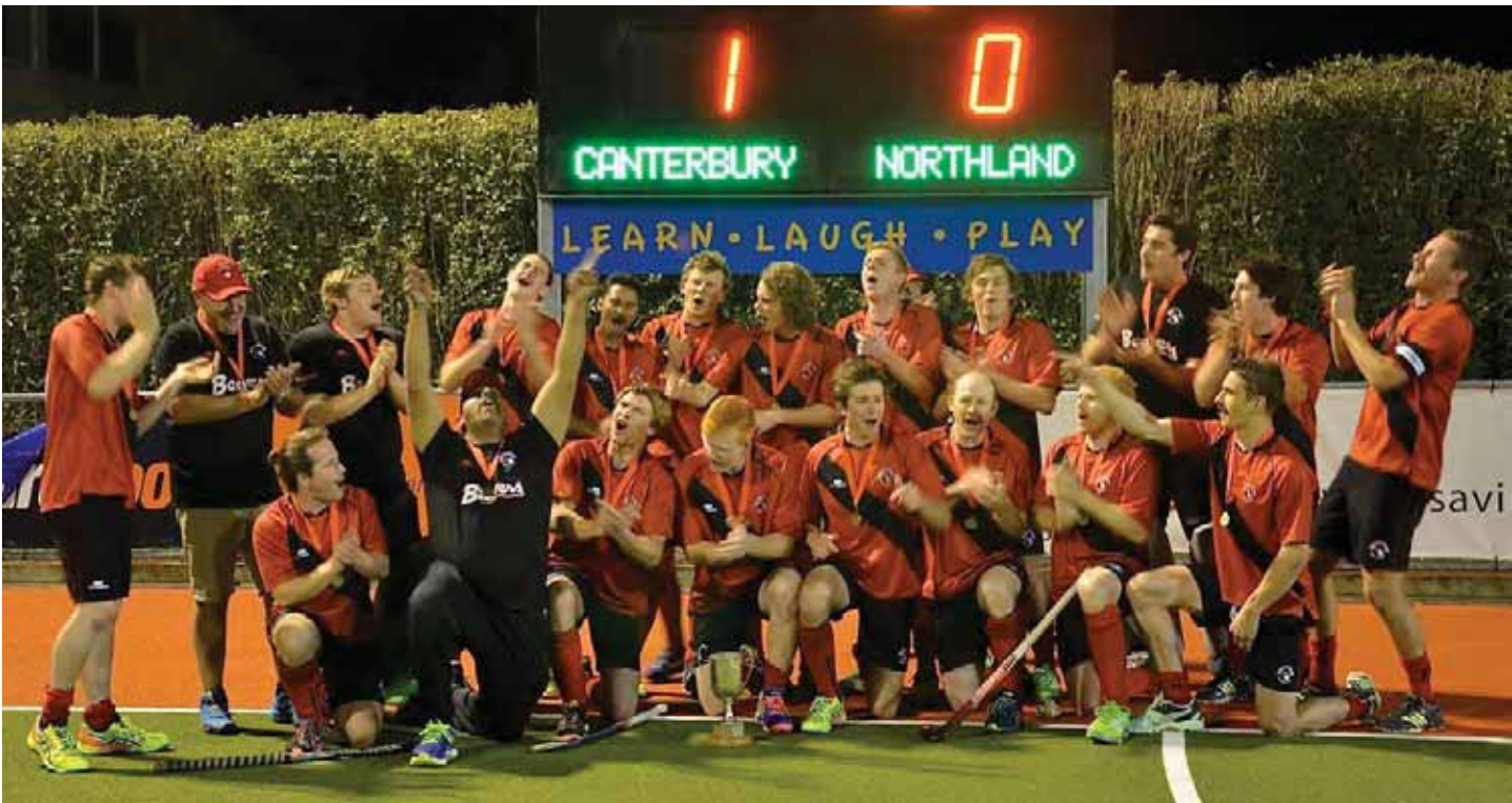
The Beavers celebrating the three-peat

An exciting final quarter had the crowd on the edge of their seats. A final flurry from the Northlanders was well defended and the Beavers were crowned national champions once again.