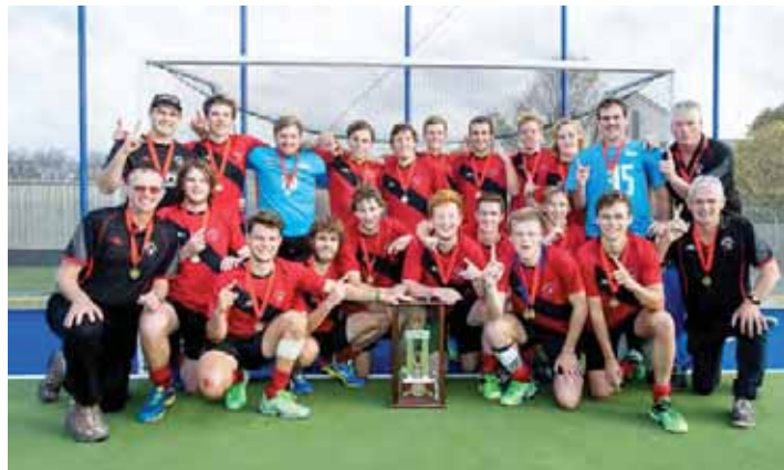
Champion Canterbury Under 21 Men