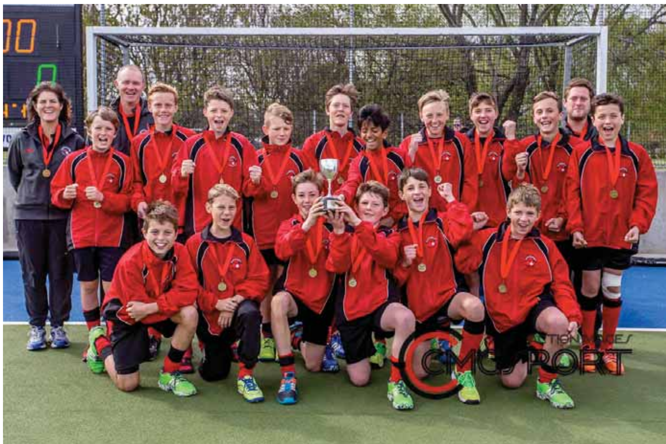
Hatch Cup Champions 2016