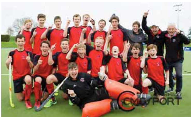
Canterbury Under 15 Championship Tournament Winners