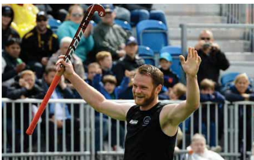
Retiring Black Stick, Brad Shaw, at the 2010 Commonwealth Games