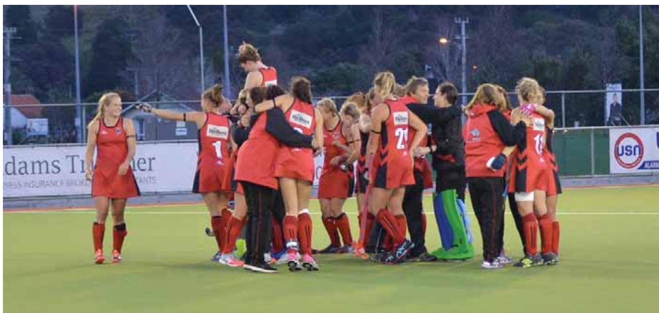
Post game celebrations for the NHL Champion Cats