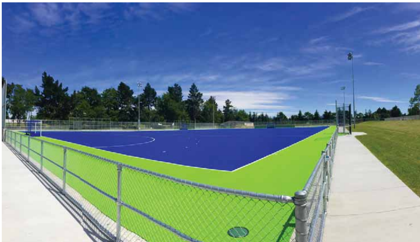
The new turf in Rangiora, slated to open in February 2017

In the Selwyn District, our efforts with the Council and local hockey supporters have resulted in the Council agreeing to build a small turf in the Fosters Recreational Park in Rolleston. In late 2016, the Board agreed to accept into our junior competitions a new club based in the Rolleston and Lincoln areas called Waikirikiri Sport. It is hoped this club will continue to grow and eventually be approved as a full member of Canterbury Hockey.