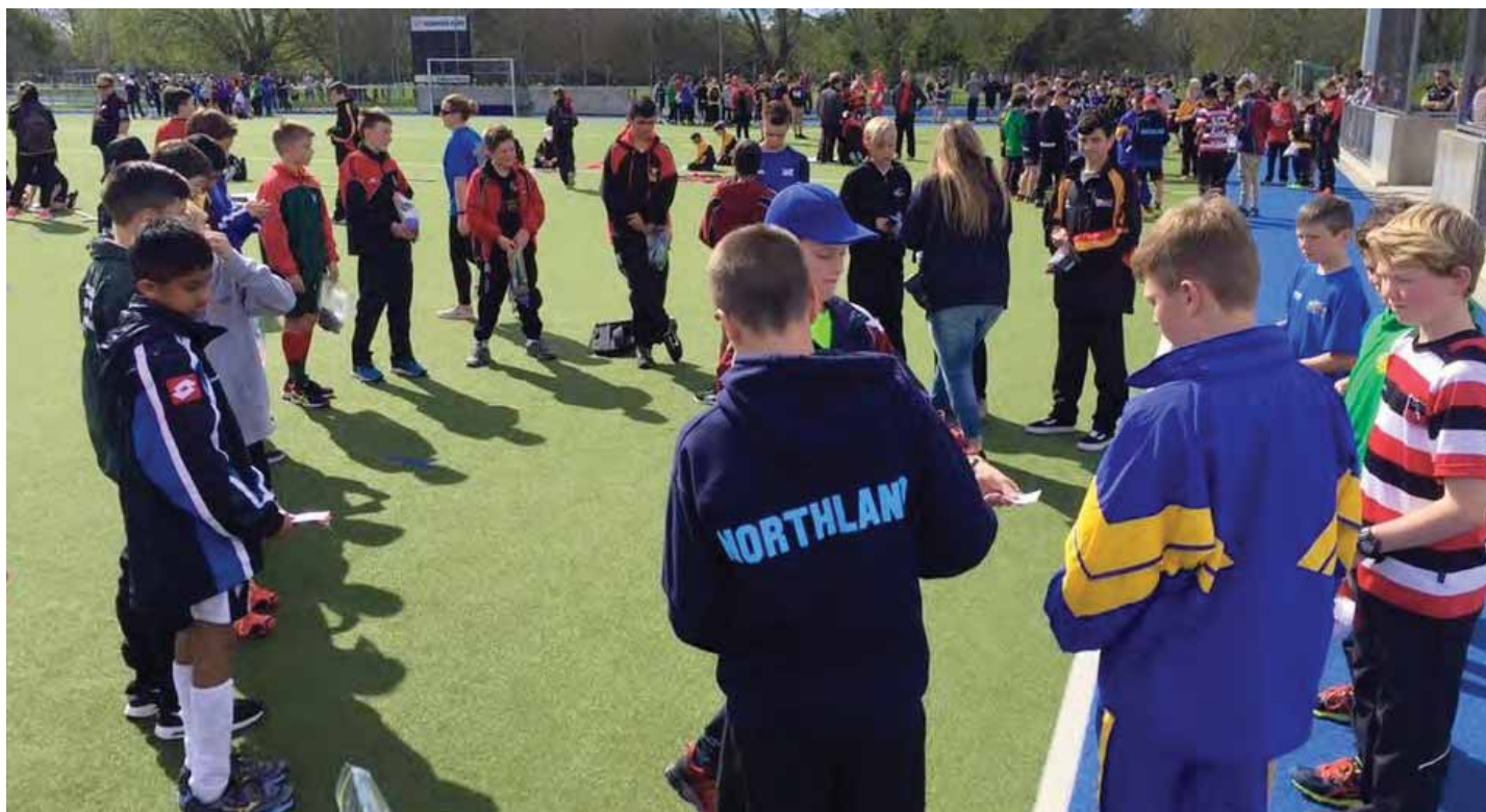
Teams at the Hatch Cup Ribbon Swapping at Opening Ceremonies

During 2016 we hosted the events that make up our normal calendar being the South Island Super 6 and Season Launch, Legends Night, our Annual Awards Dinner and Volunteers Function. In particular the Annual Awards Dinner, held at the Sixty6 function room at the Christchurch Casino, “raised the bar” yet again with a record number of attendees celebrating our individual and team achievements as well as recognising a number of our volunteers who do so much for Canterbury Hockey and our clubs and schools.