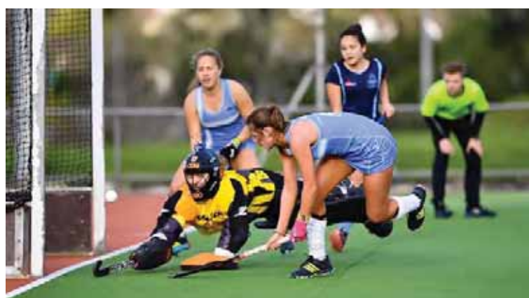
Villa Maria takes their first-ever Federation Cup title