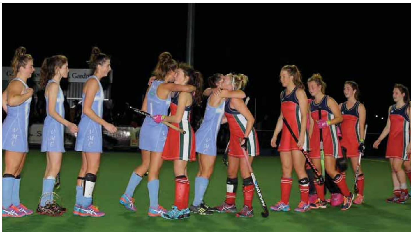
Villa Maria and St Margaret's players exchange congratulations following the SPL Final

Canterbury Hockey administered the Scholastic Sports Canterbury competitions with Boys and Girls teams in Premier and School League competitions. On the Girls' side, Villa Maria College took top honours at the Premier grade. Villa Maria added to a stellar year with their first national title, winning Federation Cup. On the Boys' side, Christ's College 1 st XI beat Burnside HS 1 st for the Premier title. St. Andrew's College was the top Christchurch Boys team at national tournament with a fourth place finish at Rankin Cup.