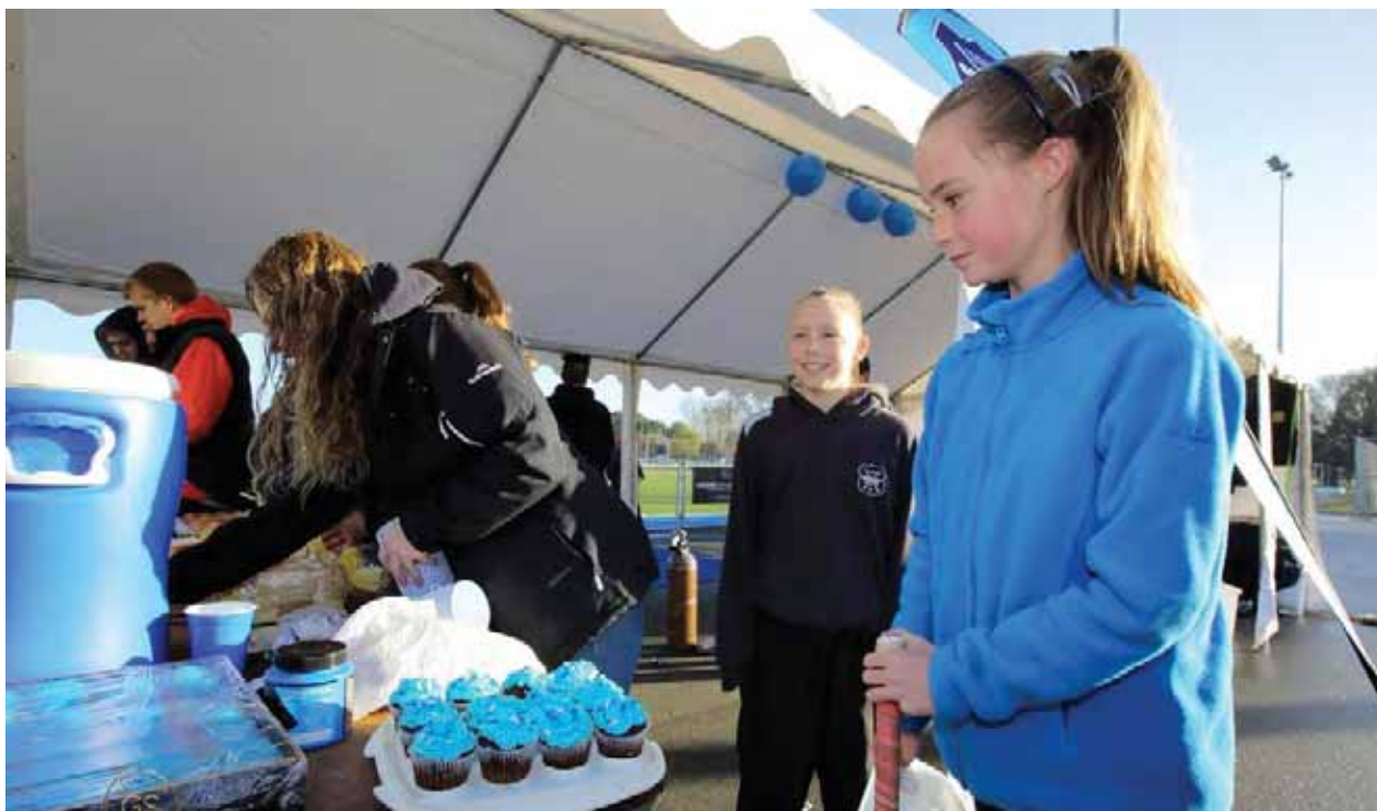
Southern United Club Day at Nunweek Park

Club development through the Clubmark programme was a major initiative. Community Hockey looked to engage with clubs throughout the season to assist with their planning and delivery of key components to club and association success. Clubs were then evaluated at the completion of the season against performance markers. Eight clubs expressed interest in Clubmark and went through pre-season planning sessions of which five received Clubmark accreditation (Harewood and University received Gold status; Avon, Marist and Southern United achieved Silver). The information gained through all club engagement was helpful in assessing club capabilities and provided Canterbury Hockey with insights around our programmes. We will look to build on club participation in Clubmark in 2017.