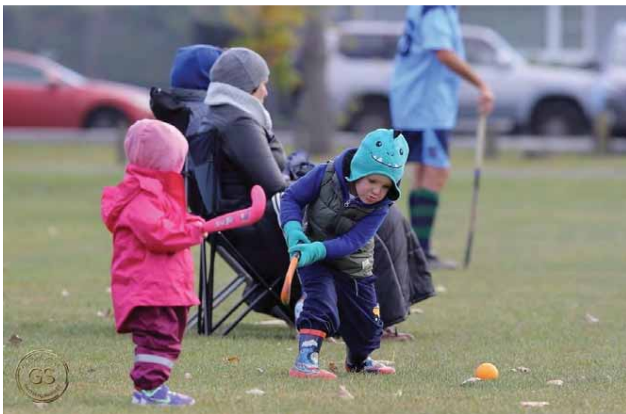
The hockey journey starts on the sidelines

Community Hockey aids in player recruitment and development along a number of pathways. Small Sticks provides school student with an introductory hockey experience, Fun Sticks gives new school year 1 and 2 aged players a platform to build on that experience to learn and master basic skills as they start to play hockey. Canterbury Hockey supports clubs in delivering Fun Sticks locally. In 2016, Community Hockey assisted eight clubs as they started 426 boys and girls on their hockey journey through Fun Sticks.