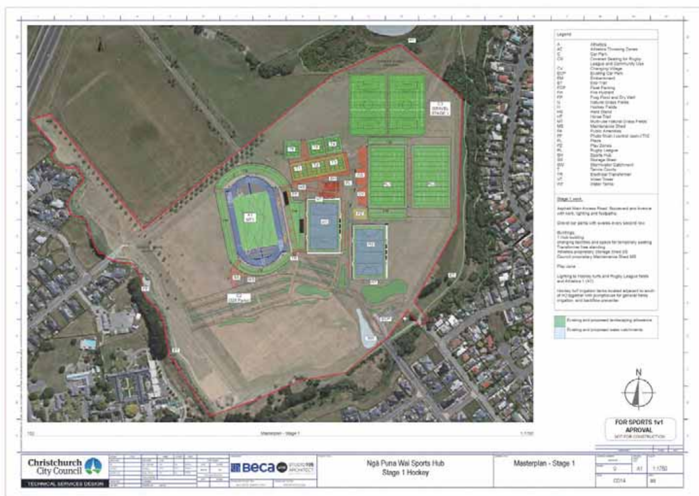
Nga Puna Wai Stage 1 Plans