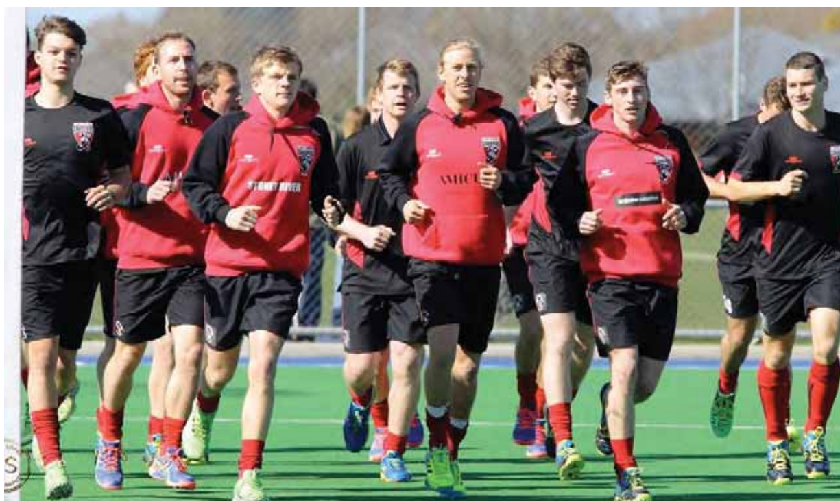
Cavaliers warm up at Marist Park