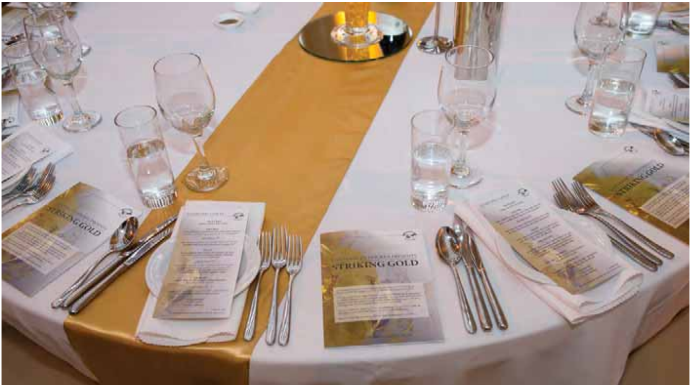
The table is set for Striking Gold

In delivering the Event we were limited by the capability of our venue, the Transitional Cathedral. While its optimum seating for comfort is around 220, we had such demand the final number accommodated was 260. We saw the launch as being a national one and we had demand from throughout New Zealand. A number of team family members came from overseas. The following morning we held a community event at Nunweek Park where over 250 members of the local community mingled with the 1976 team and had books signed.