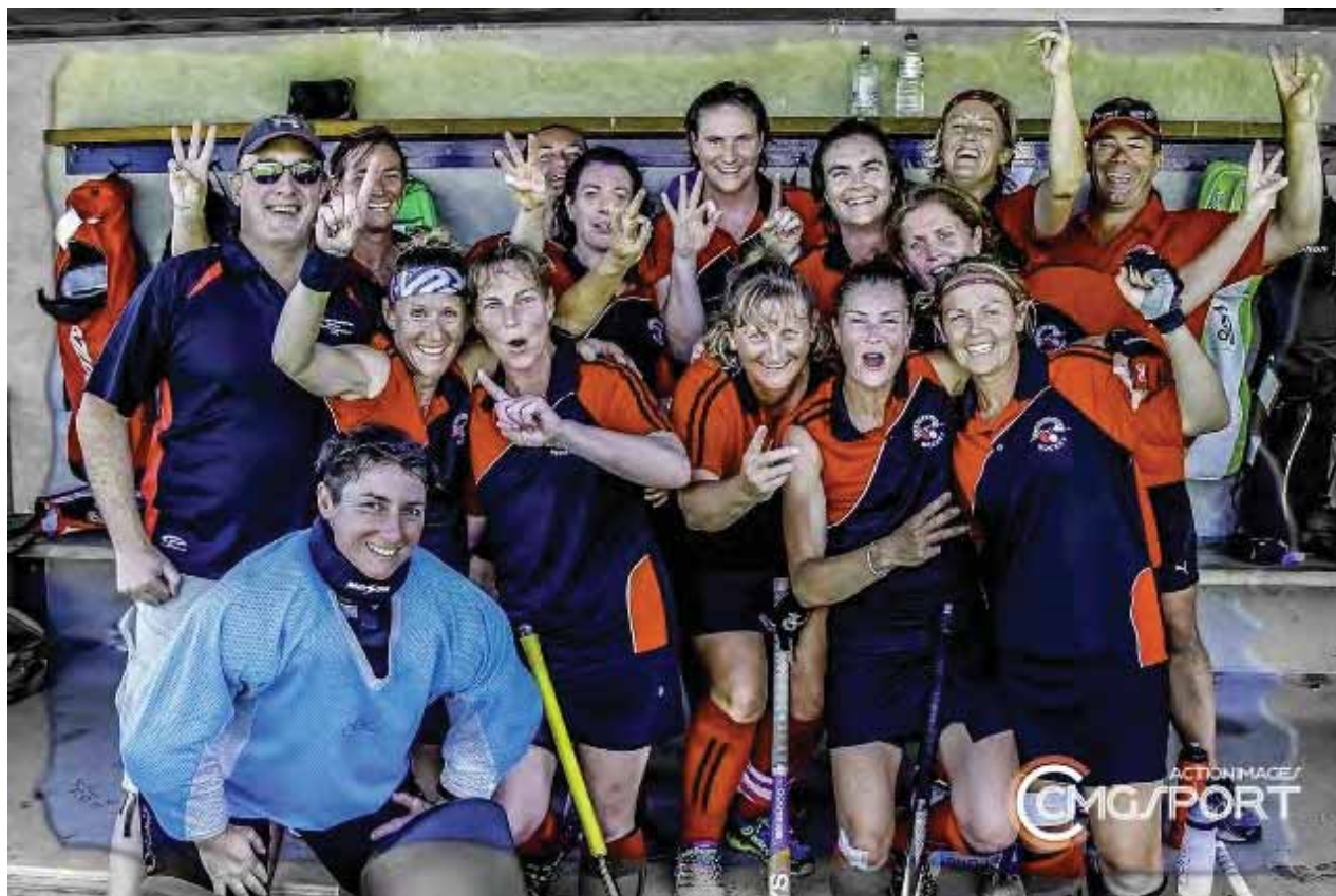
Three-peat champions, Masters 40+ Women